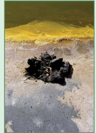
Site showing acid sulphate soils

The project achieved its two aims: to survey a large number of inland NSW wetlands for the presence of sulphidic sediments and to develop a decision-making tool to help managers identify wetlands containing these sediments. The team sampled 81 locations along seven major rivers. Testing revealed that about 20 per cent of the samples tested either definitely or probably contained sulphidic sediments, and half of these may undergo acidification. The assessment tool will help managers decide whether they need to undertake further tests on sediments with the potential to be sulphidic. This tool will help in decision-making in wetland management.